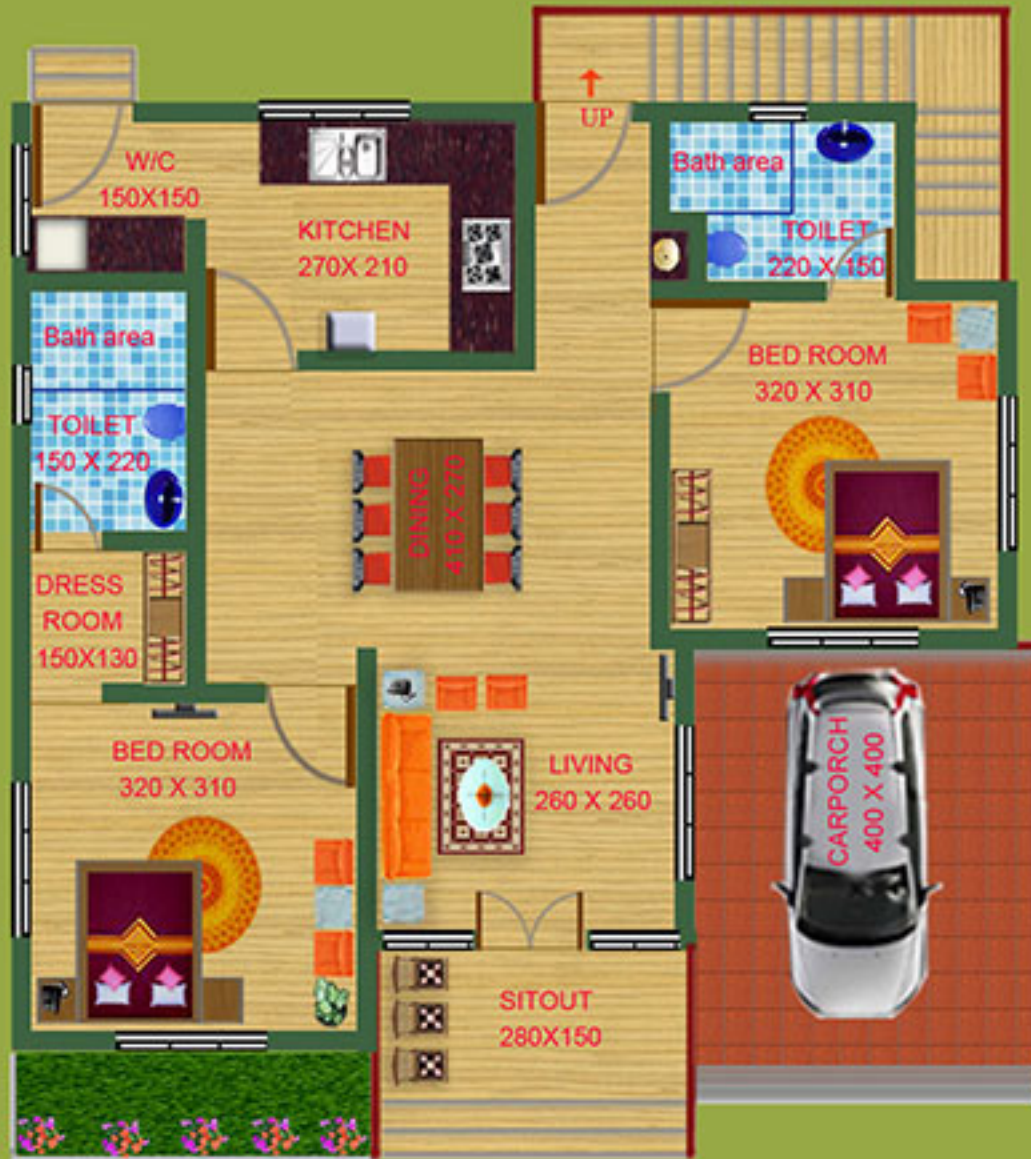
FLOOR PLAN AREA - 1000 Sq.Ft