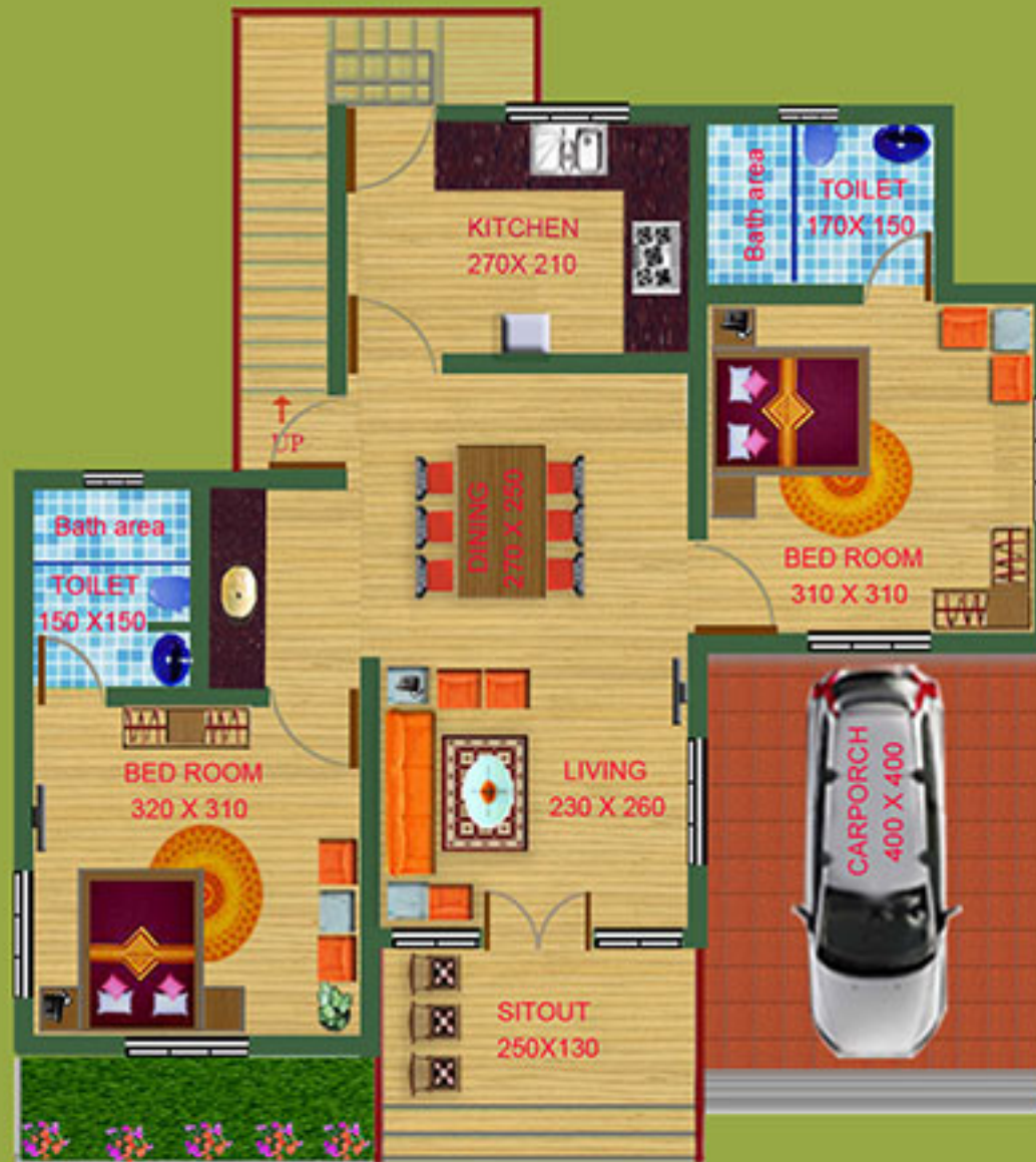
FLOOR PLAN AREA - 817 Sq.Ft